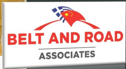
INVEST IN GREECE ONLINE FORUM 2020-2020外洽会系列线上论坛——投资希腊