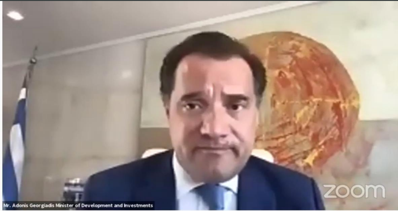
Mr. Adonis Georgiadis Minister of Development and Investments