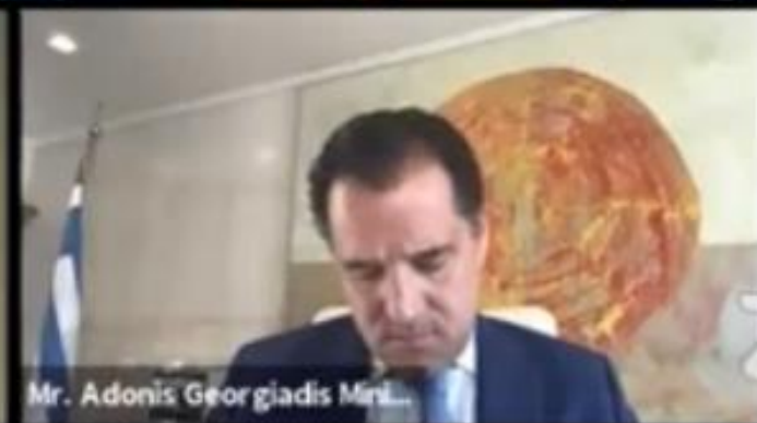
Mr. Adonis Georgiadis Min...